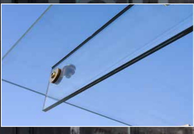
SentryGlas<sup>®</sup> interlayer strength and non-yellowing clarity enable use in elegant indoor and outdoor structural applications such as glass canopies, fins and balustrades.