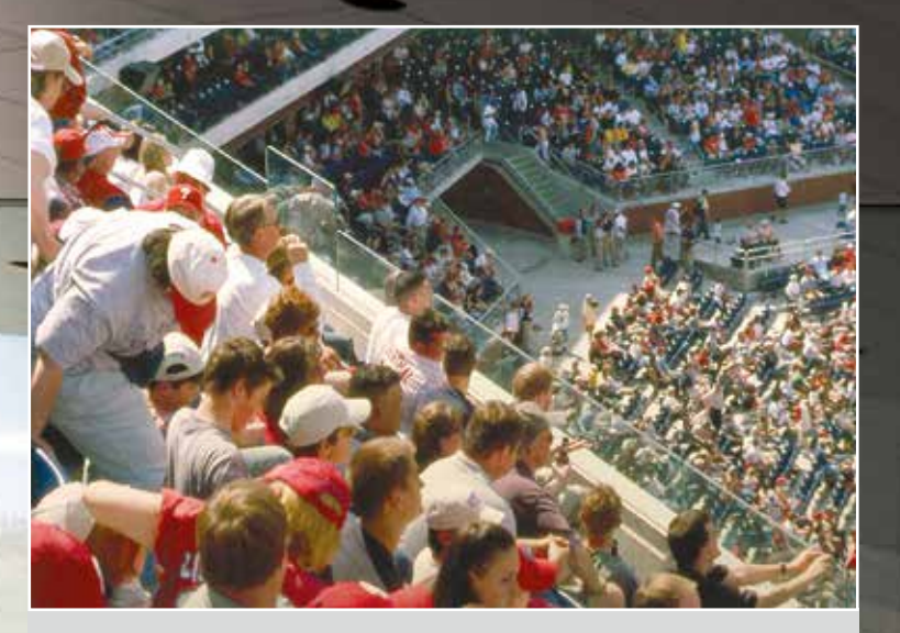
The strength and open-edge durability of SentryGlas<sup>®</sup> interlayer enable frameless safety glass balustrades at sports stadiums

Originally created for specialty markets such as high-security glazing and hurricane windows, SentryGlas<sup>®</sup> ionoplast interlayers now are being specified wherever architects or engineers need a material that can make a difference in glass performance.